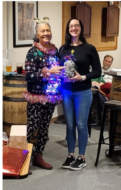
Legion Rider 290 Holiday Party December 7, 2024.