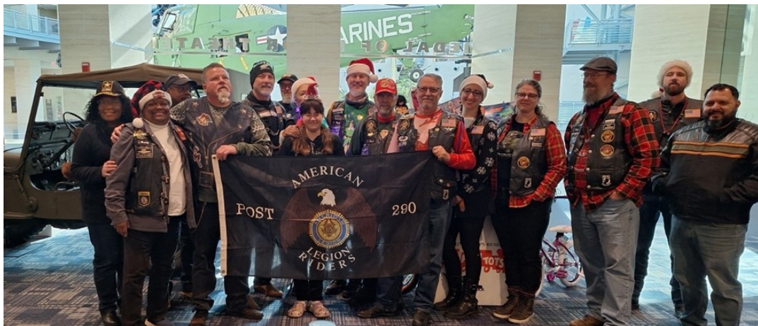
November 9, 2024 – Members of The American Legion Riders 290 at the National Museum of the Marine Corps for the ALR-290's annual Toys for Tots run.